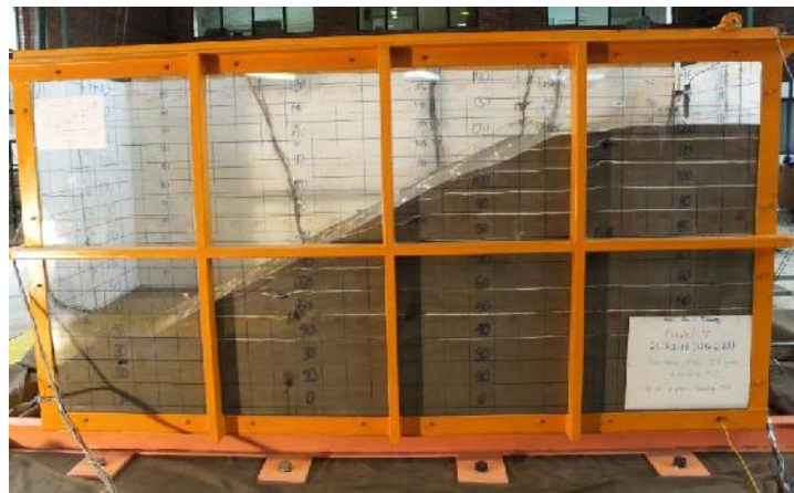
Figure 2. Physical modelling of buried pipeline response in soil slopes due to seismic loadings (Derakhshan Ghazani, 2014)