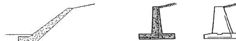
Figure 2. Inclined and Vertical retaining walls

In this study plain strain numerical analysis is performed using Plaxis dynamic program. The studied soil is chosen dense granular sand and modeled as elasto-plastic material according to Mohr–Coulomb criteria while the gravity wall is assumed elastic. Structural damage and serviceability criteria adopted in existing codes and guidelines are illustrated. A series of results of numerical analyses conducted with a FE code and the influence of some parameters on the results of dynamic analysis are discussed.