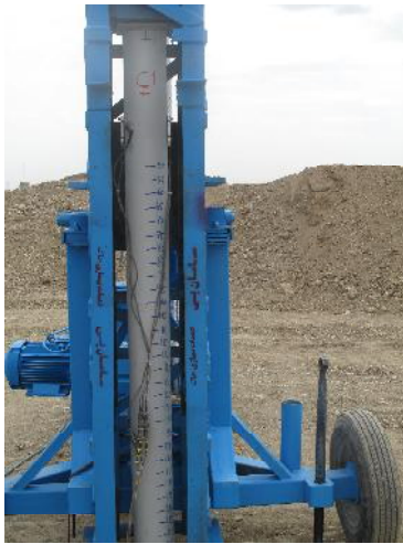
Figure 1. Pile driving system