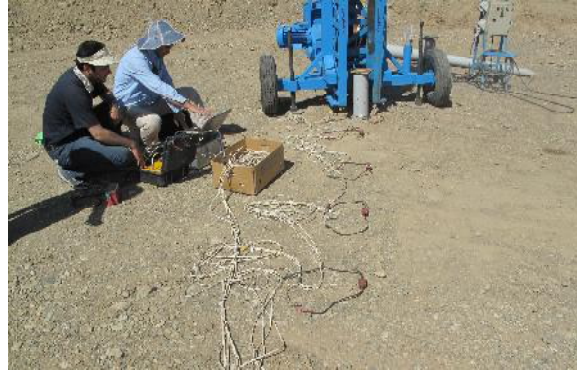
Figure 2. Geophones arrays

By comparing the period of PPV diagrams because of Pile-C and Pile-T driving, the frequency ranges were calculated between 50 and 55 Hz. The average wave speed in the ground was also measured 346.26 and 425.01 m/s during the driving of Pile-C and pile-T. The effect of source shape is seen obviously in these cases. The results of wave propagation and the induced velocity in the soil at different distances from the pile-C are shown in Figure 4. With comprising PPV in different time, it is concluded that the vibration amplitude and radius decrease with increasing the distance from the pile. Due to material damping in the soil and pile and radiation damping, the propagated waves are dissipated.