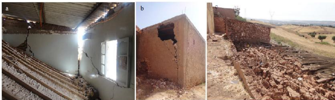
Figure 2. a) Tilt and Detachment of the wall undergoing the out-plane deformation due to roof collapse in Douar Legouatine the wall undergoing the in-plane deformation shows a deep crack perpendicular. b) The presence of diaphragm in this house has prevented the collapse of the wall undergoing the out-plane deformation, but the rupture of the diaphragm, shown in this photo, has caused a detachment and an inclination of the wall. c) The collapse of walls is perpendicular to the slope of the crest

The spatial variability between the intensity and damage caused by this earthquake, and the wide gap between its magnitude M_L = 5.2 and the intensity observed in the field (VIII on the MSK scale) are to be connected to topographic conditions and by the seismic amplification effects. Indeed, the most affected area with the maximum intensity of VIII is at Douar Legouatine, located atop of crest topographically highest (274m high) consisting of an anticlinal fold trending NE-SW elongate over 10Km long and less than 2 Km wide. Bouguirat Area (70m high), yet closer to the epicenter, showed a lower intensity of about VI. These observations on buildings in the same class of vulnerability EMS98 show that masonry houses of vulnerability class A and B have suffered at the village almost total destruction in a preferred direction, perpendicular to the extension of relief, then the same type of construction at the bottom of the ridge only show some cracks which correspond to an intensity level of VI EMS98. A comparison of the cumulative damage along the crest showed a significant topographic site effect in Legouatine