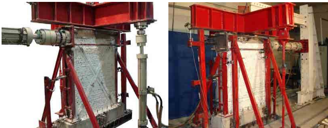
Figure 3. Masonry walls' experimental tests