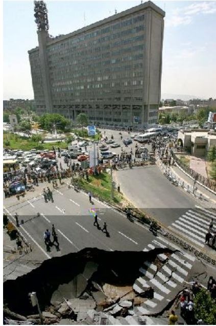
Figure 4. Land subsidence due to collapse of Qanat in Tehran

The experiences of Bam Earthquake of 2003 that occurred in south of Iran, depicted the importance of Qanats in earthquake. In that event, collapse of Qanats caused considerable damages to buildings and infrastructures, specially road networks and water supply of the Bam. Therefore it can be expected by collapse of Qanats during a potential earthquake in Tehran, the damages and casualties may increase to some extent.