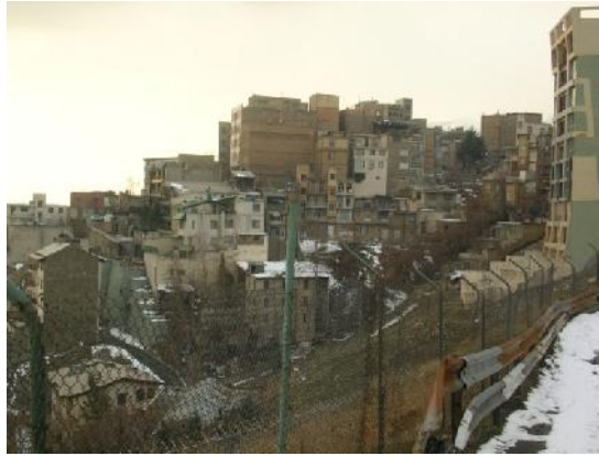
Figure 2. Construction of vulnerable structures on unstable slopes in North of Tehran

Besides of landslides, due to high level of underground water table and grainy deposits in some parts of Tehran, there is the risk of liquefaction in these places. However, there is no evidence of liquefaction in the history of Tehran, but recent studies depicted that due to increase of table, there is the possibility of such hazards at local levels in the central parts of Tehran.