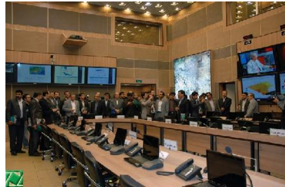
Figure 8. Old and new EOC's in Tehran Disaster Mitigation and Management Organization (TDMMO)

The first command room in Tehran was built in 2004 in TDMMO for making necessary measures for disaster management. The center initially lacked features required for damage estimation and emergency telecommunications, but gradually necessary facilities were installed in the center. At the moment, the new building for this purpose is constructed and operational that has all necessary software and hardware required for emergency response management. This center is now equipped with cameras monitoring the city (traffic control), MPLS lines and telecommunications systems (satellite and ground communications), specialized applications such as quick damage and loss estimation system, monitoring systems (such as seismic network, and meteorology forecasting system) and other related systems needed for monitoring and emergency response operations. In addition the design of new building makes it safe to encounter any strong earthquake that may occur in or around the city.