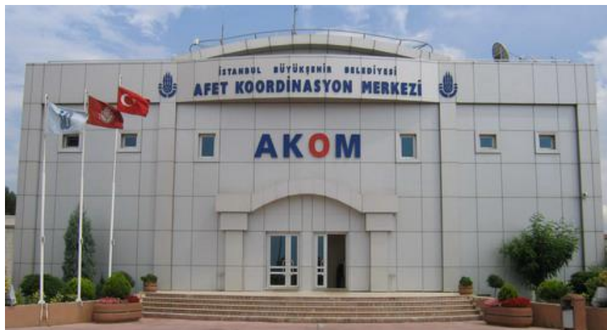
Figure 5. Incident Management Center in Istanbul (AKOM)

In some cities in Turkey there are also some local EOC to provide necessary disaster management at local levels. For example in the city of Istanbul a disaster management center called AKOM is established (Figure 5).