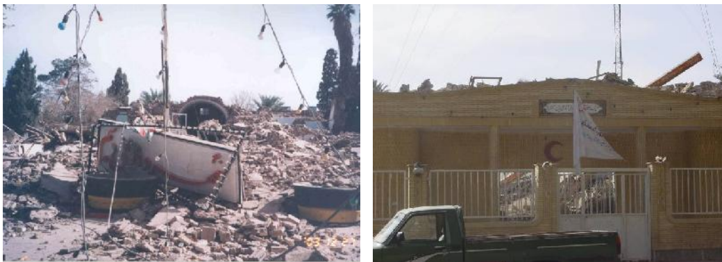
Figure 2. Damages of municipality and Red Crescent buildings in Bam

The most important change in disaster management system of Iran before occurrence of the Bam Earthquake was approving the rescue and relief master plan in the Council of Ministers (March 2003). Although general approval of that plan made it executive but unfortunately, none of the guidelines and standards had been approved or developed before the Bam Earthquake. In addition, in that event again there was no emergency response command center equipped with necessary facilities and guidelines in the city that could be operational after the earthquake. In fact, various bases and many important buildings (such as Red Crescent Building, City Hall, etc.) were damaged or completely collapsed by the earthquake and thus using them as the commanding center was not possible (Figure 2).