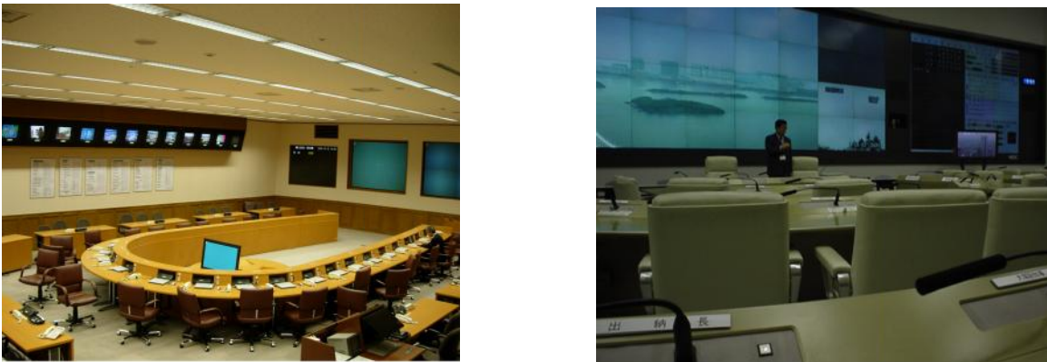
Figure 3. Examples of emergency response management centers in Japan; Right: Tokyo; Left: Kobe

Japan: In Japan, especially after the great Hanshin-Awaji earthquake (1995), the importance of integrated emergency response management were depicted more clearly to the officials, so development of EOC at different levels was considered as an important priority. For example, the disaster management center in Hyogo prefecture established in Kobe in 2000 with the aim to improve emergency response activities (Figure 3).