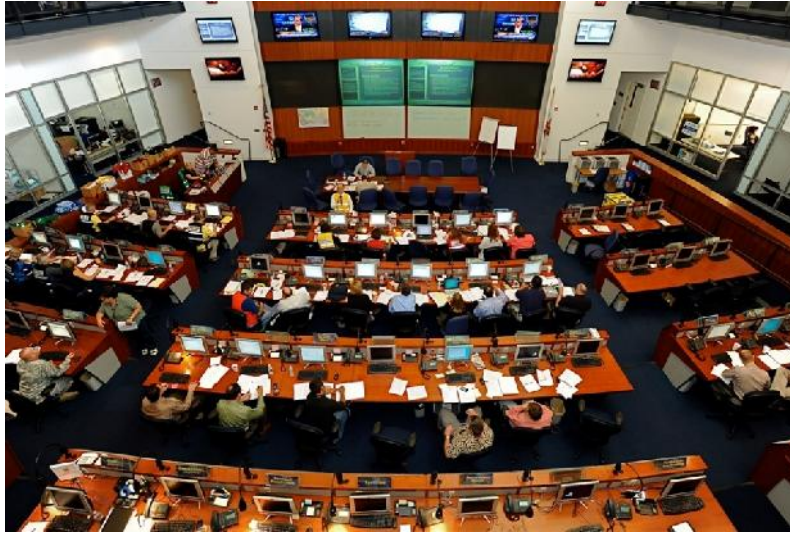
Figure 7. A view of one of the Emergency Operation Centers in the United States