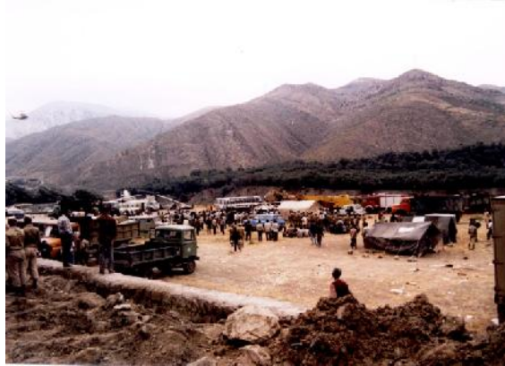
Figure 1. Establishment of disaster management command center in the vicinity of the earthquake affected areas in Manjil City after The Manjil Earthquake of 1990

organizational structure for disaster management and appropriate emergency operation center (EOC) at the time of Manjil Earthquake, some field bases were established in the affected cities to be used as field EOC's (Figure 1). However, these bases were not supplied with appropriate information and communication systems as well as initial action plans and the necessary infrastructures. This deficiency caused extra difficulties in management of response during the golden hours aftermath.